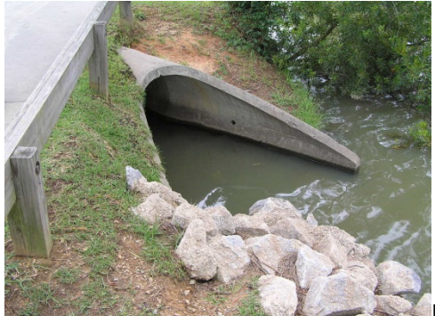
EXHIBIT 5 – SPECIAL PROVISIONS AND CONTRACT REQUIREMENTS